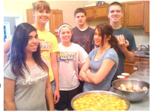
YAR served breakfast for lunch at the Friendship Kitchen.